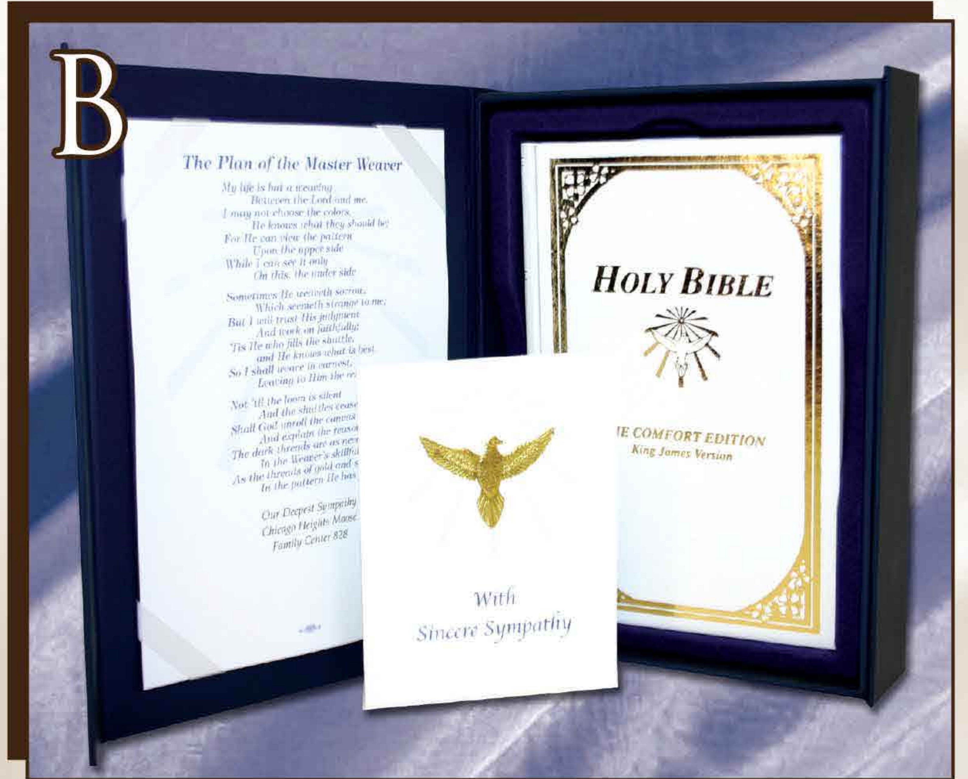
Available only for custom imprinting and in quantities of 6 or more.

A Memorial Bible in Stratford Presentation Case—Quality grain-finish; step in lid for attractive presentation; handsome gold-embossing.