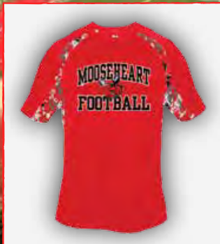
523 Red/Camo Football Dri-fit Short Sleeve Shirt S-XL $19.95 2XL $21.95 3XL $23.95 4XL $23.95 5XL $37.95