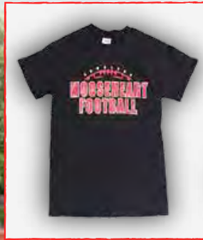
637 Black Football T-Shirt Screen Printed Logo S-XL $10.95 2XL $12.95 3XL $14.95 4XL $16.95 5XL $18.95