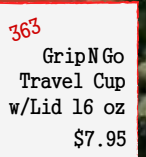
363 Grip N Go Travel Cup w/Lid 16 oz $7.95