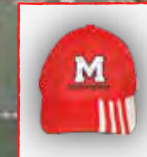
418 Cap Red/White Embroidered Logo $12.95