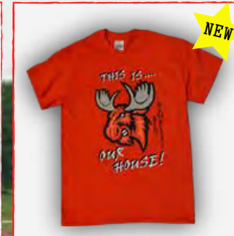
473 Red "Our House" T-Shirt Screen Printed Logo S-XL $12.95 2XL $13.95 3XL $14.95 4XL $15.95 5XL $16.95