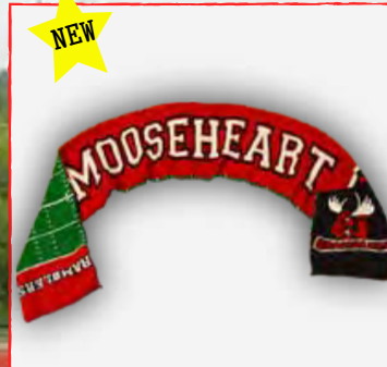
324 Red Rambler Knitted Football Scarf Dual Sided Logos $24.95