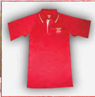
525 Red/White Cool Tek Polo Embroidered Logo S-XL $29.95 2XL $31.95 3XL $33.95 4XL $35.95 5XL $37.95