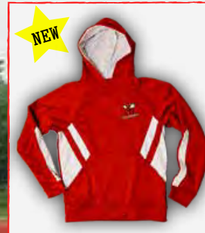
382 Red/White Performance Hooded Sweatshirt Embroidered Logo S-XL $42.95 2XL $44.95 3XL $46.95