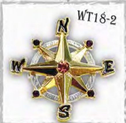
Crystal Compass Pin $7.00 $3.50

1/2 Price on limited items While Supplies Last