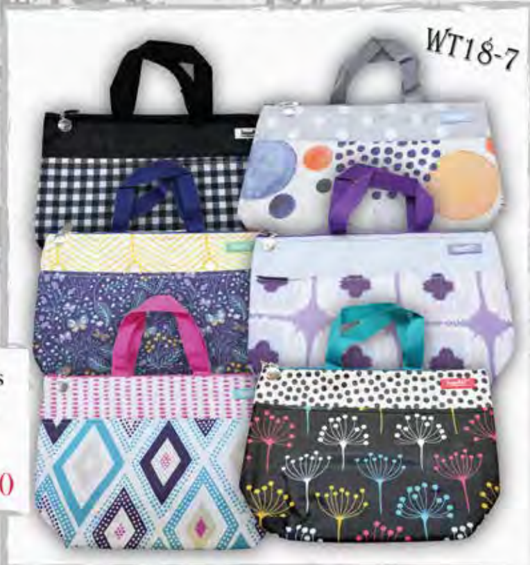
Thermal Lunch Totes w/ Compass Charm Assorted Designs $9.00 ea. $4.50

Limited Quantities Available Subject to Prior Orders