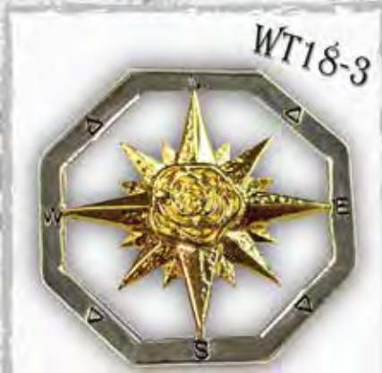
Two Tone Compass Pin $7.00 $3.50