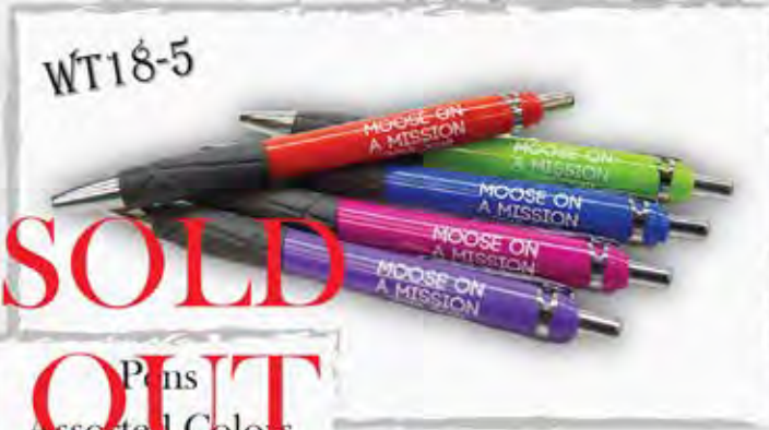
SOLD OUT Pens Assorted Colors $0.99 ea. $0.50