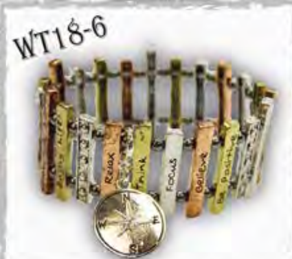
Stretch Bracelet w/ Compass Charm $14.00 $7.00